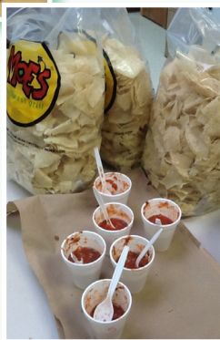
Chips and Salsa from Moe's

In celebration of Cinco de Mayo, Moe's donated enough salsa and chips to feed the Kindergarten students at Greene Primary! The students began their fiesta by learning a little about the Mexican cul-