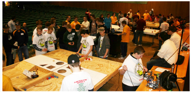
Head to Head Competition Board in the Auditorium of GCS